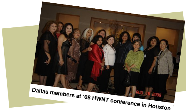
Dallas members at '08 HWNT conference in Houston

The students are exposed to positive role models through career panels comprised of HWNT members and student panels comprised of College students.