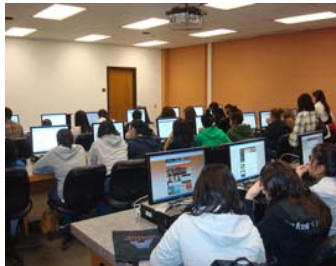
Students learning about Financial Aid and College application process

The mission of the Education Seminar Series is to encourage Latina girls to graduate High School and attend college. The series include three free seminars designed to encourage Latina High School students to graduate and attend college while developing leadership skills. In addition to providing students with college and financial aid information, the seminars build leadership skills, self-esteem and cultural awareness through the workshops.