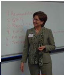
Below, various members volunteering at a UTA Education Series in '08