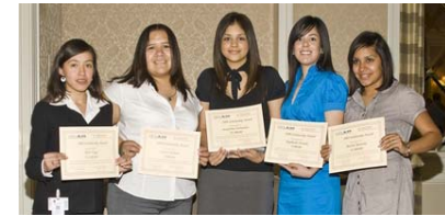
'08 Scholarship Recipients at Awards Ceremony.