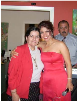
Members at Red Carpet Affair recognition event.

The Hispanic Women's Network of Texas is a statewide organization comprised of individuals from diverse backgrounds. Our mission is to advance the educational, cultural, social, legal and economic well being of all women through a broader awareness of our role in society, business and family. Members celebrate the positive image and values of the Hispanic culture.